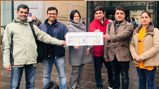
The members of Indian community took part in the initiative by KAV and visited the historical museum Bonn.