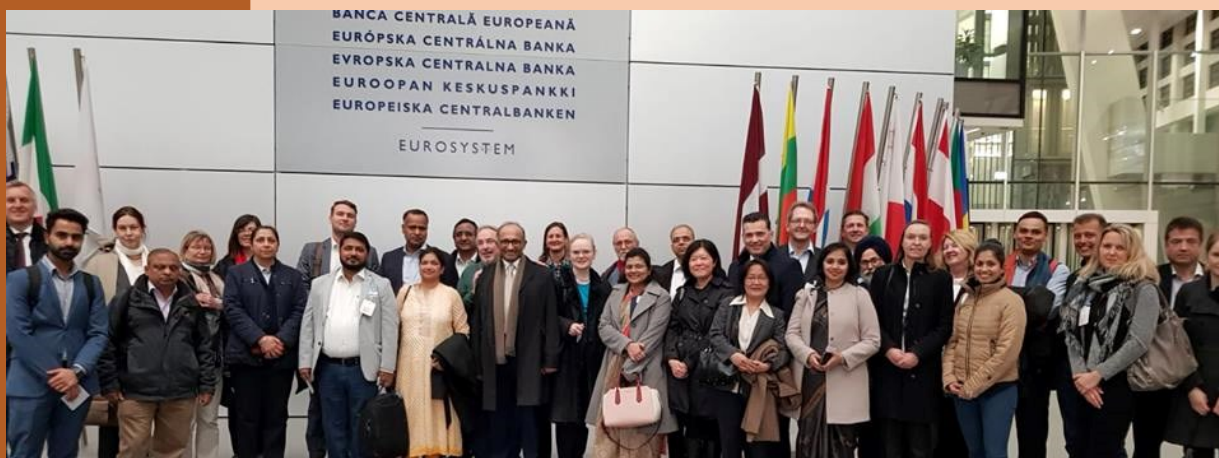
CG attended the “India meets FrankfurtRheinMain-Let’s talk business” event organized by the IHK Frankfurt am Main at the European Central Bank headquarters in Frankfurt.